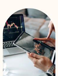
TRADING & SERVICES