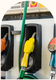
PETROLEUM, GAS & OIL