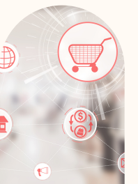
FMCG & RETAIL