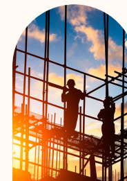
CONSTRUCTION & INFRASTRUCTURE