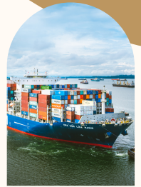
SHIPPING & LOGISTICS